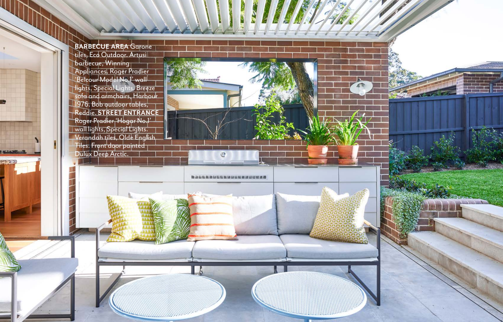
BARBECUE AREA Garone tiles, Eco Outdoor. Artusi barbecue, Winning Appliances. Roger Pradier 'Belcour Model No.1' wall lights, Special Lights. Breeze sofa and armchairs, Harbour 1976. Bob outdoor tables, Reddie. STREET ENTRANCE Roger Pradier 'Hogar No.1' wall lights, Special Lights. Verandah tiles, Old English Tiles. Front door painted Dulux Deep Arctic.