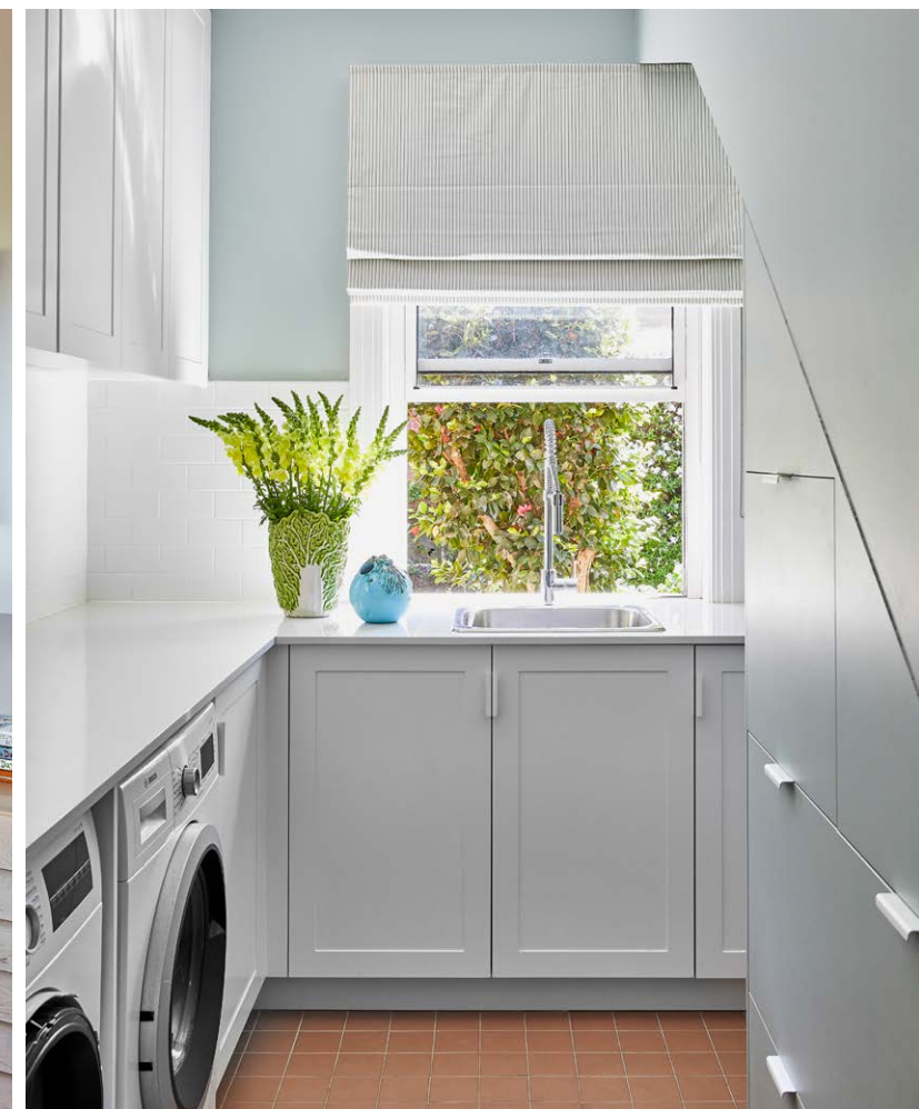
ILLUSTRATION KENZIEDSIGN.COM CUSTOM BLINDS MADE WITH FABRIC BY (ABOVE LEFT) DIANE BERGERON AND (ABOVE RIGHT) JIAN MANKIN (TRY FABRIC STUDIO) FLOOR & WALL TILES (ABOVE RIGHT) OLDE ENGLISH TILES 'LET ITUCE VASE TAPWARE RESE HANDLES INDEX + CO 'IL FANALE 'MOLECULA' PENDANT LIGHT (OPPOSITE) LIGHTCO ACTUAL PAINT COLOURS MAY VARY ON APPLICATION