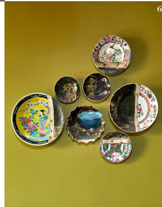
TABLE LAMP (#1) ORIENT HOUSE ARTWORKS (#1) DANA DION (#3) JOANNA GOMBATTO (#5) JEN ELLIS (#7) VINTAGE FIND ACTUAL PAINT COLOURS MAY VARY ON APPLICATION